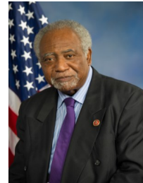
Congressman Danny K. Davis* 7th District of Illinois